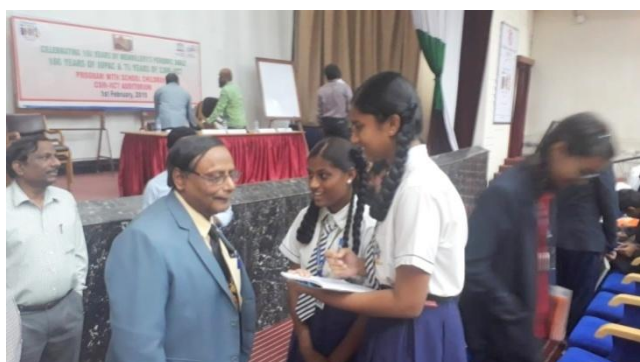
The Indian Institute of Chemical